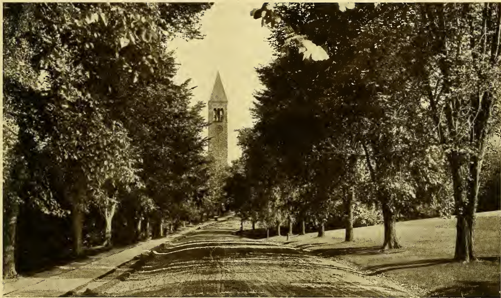
CENTRAL AVENUE LEADING TO QUADRANGLE